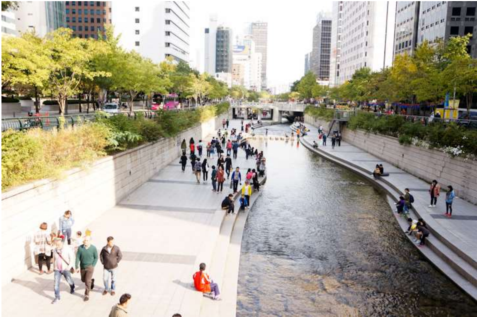
Example of Seoul's Cheonggyecheon river